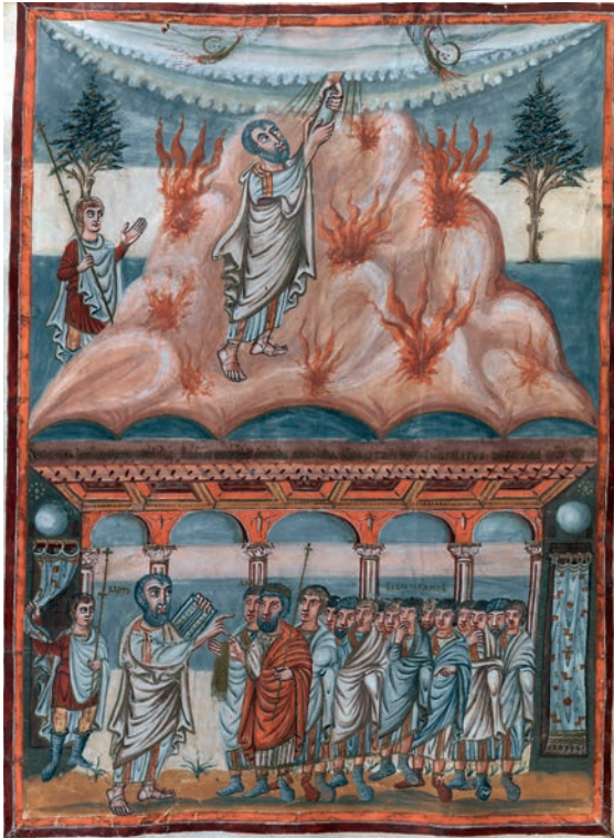
Fig. 3. Exodus frontispiece in the Grandval Bible. London, British Library, Add. MS 10546, f. 25v.

Christian supercessionist projects in the Middle Ages. 16 In the Grandval Bible's Exodus image, the sign of the cross on the curtain on the right side of the lower register, the depiction of Moses with Paul's face, and the titulus within the image transforming the "filii Israhel" into the "populus Christi," together reconfigure the Tabernacle after a Pauline blueprint. 17 The figure of Joshua drawing back the curtain from the Holy of Holies in the image, Kessler demonstrated, is a pictorial deviation from scripture, motivated not only by a long-lived Christian exegetical identification of Joshua and Jesus, but also by Paul's insistence in the letter to the Hebrews that Christ's self-sacrifice put an end to Levitical observances and made previously hidden, divine mysteries accessible. 18