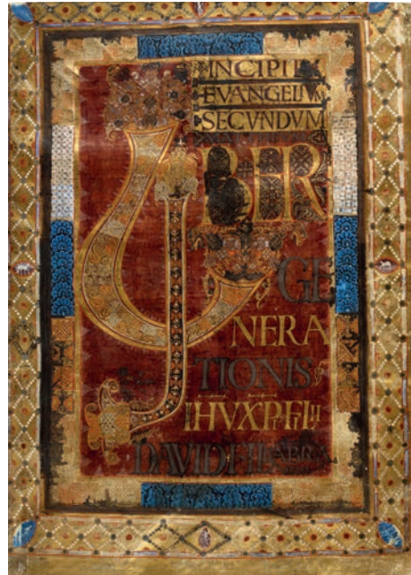
Fig. 6. Incipit page for Matthew's Gospel in the Soissons Gospels Paris, BnF, MS lat. 8850, f. 18r.