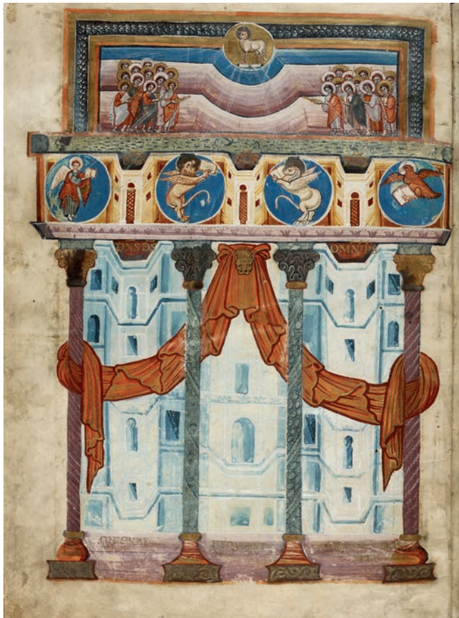
Fig. 1. The “Adoration of the Lamb” painting in the Soissons Gospels: Paris, BnF, MS lat.-8850, f. 1v.

(Fig. 1). 2 Much of the pictorial field is given over to the representation of an architectural space, or rather spaces. Moving from the bottom to the top of the composition, four fictive stone columns with gold and silver Corinthian-style capitals are sited upon a horizontal band of orange pigment, that serves simultaneously as a groundline and a framing element. A parted