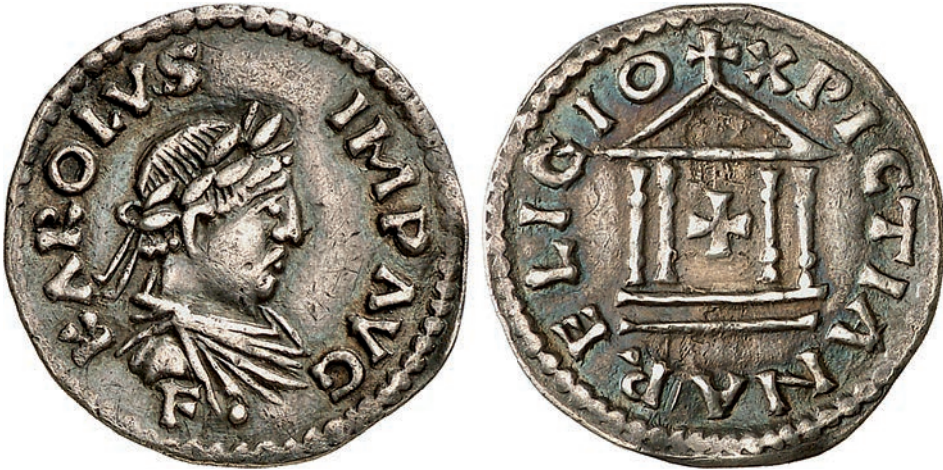
Fig. 4. XPICTIANA RELIGIO coin issued by Charlemagne. Berlin, Münzkabinett der Staatlichen Museen zu Berlin, Inv. No. 18202748.

narii feature a pedimented tetrastyle temple, crowned by one cross, occupied by another, and encircled by the legend XPICTIANA RELIGIO (Christian Religion/Faith), rendered with both Greek and Roman letter-forms.