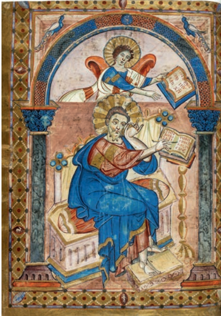
Fig. 5. Evangelist portrait page for Matthew's Gospel in the Soissons Gospels : Paris, BnF, MS lat. 8850, f. 17v.

The manuscript's canon tables feature depictions of veined stone columns and intaglio gemstones, some of which, like those integrated into the manuscript's Evangelist portrait pages and incipit pages, are iconographically charged (Figs. 5 & 6). 34 Structuring hermeneutic access and imaginative ingress to the Gospels by way of an imposing arcade that rewards close scrutiny, the Soissons Gospels' canon tables collectively describe a superlative, sumptuous architect-