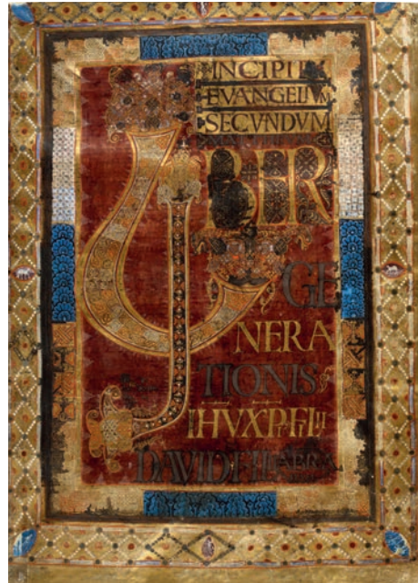
Fig. 6. Incipit page for Matthew's Gospel in the Soissons Gospels Paris, BnF, MS lat. 8850, f. 18r.