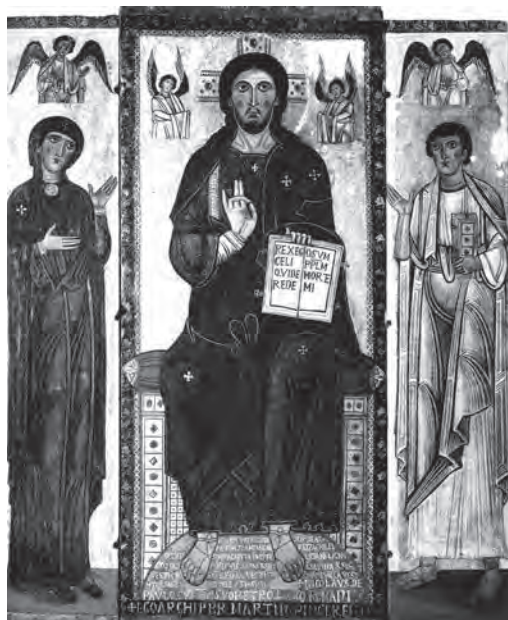
Fig. 13. Christ in Majesty, 13th c., Rome, Museo nazionale dell’art antica

John the Deacon also records that, in his day, fragments from the Holy Land were arranged “sub pedibus” the Acheropita 49 , that is, those in a sixth/seventh-century wood box (Vatican, Museo; Figs. 14-16) 50 . Indeed, drops of candle wax on the lid are evidence that, at some point at least, the reliquary was positioned atop an altar 51 . When the arrangement of icon and stones was first contrived for the St. Lawrence chapel is unknown; but it would seem to go back before the eleventh century. The Liber