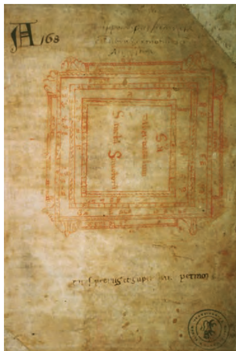
Fig. 6. Valenciennes, Bibliothèque municipale, Ms. 99, fol. 2r

The Ark of the Covenant typology was rendered with exceptional economy on the entry wall of the Virgin Mary Chapel that the Emperor Charles IV constructed ca. 1358-65 in his