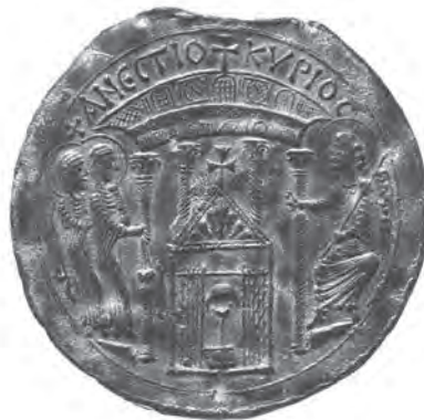
Fig. 4. Three Marys at the Tomb, 6th/7th c., ampulla, Washington, DC, Dumbarton Oaks

817, fol. 60r), the point is dramatized by picturing the sarcophagus' lid propped open and the angel sitting on top of it pointing emphatically at the interior occupied only with the vacant shroud. Two tituli make the point clear. Below: Ecce locus ubi poseur[un]t eu[m] and above: Hic erit contemplandum quo modo angelus celestis testabat[ur] XPM resurrexisse a mortuis 7 . The viewer is called on first to examine the place where Christ's corpus had been laid and, like the Maries, see with her or his own eyes that it is empty, and then to "contemplate" the miraculous resurrection.