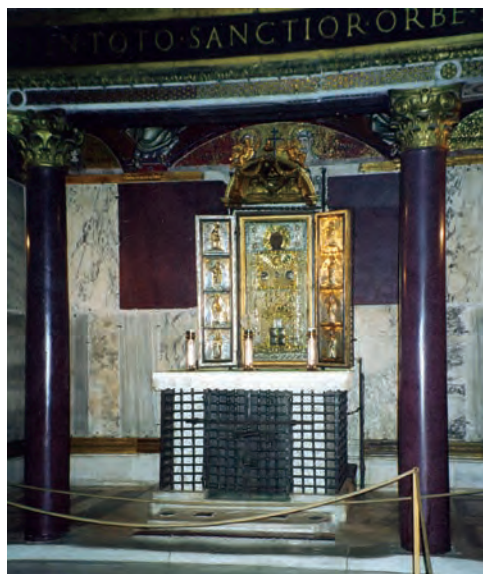
Fig. 12. Altar and acheropita , Rome, Sancta Sanctorum

he returned at sixty-one years old in 1378, he examined the Ste. Chapelle relics individually 28 . The precious relics had, in turn, been pillaged by the Crusaders from another royal church, the Pharos Chapel in the palace of the Byzantine emperors in Constantinople. Known only through written documents recently analyzed by Alexei Lidov 29 , the Pharos Chapel was mentioned first in 769 and, by the twelfth century, included many Passion relics, including a fragment of the cross, a piece of stone from Christ's tomb, the lance, the Lord's sandals, and an icon "not made by human hands", the Mandyion. Although none of the documents likens the Pharos Chapel specifically to the Old Testament Ark, a connection is implicit in the claim that the imperial inner sanctum housed the Ten Commandments and in an allusion (ca. 1200) to a katapestasma , the word used in the Septuagint for "the inner shrine behind the curtain, where Jesus has entered, having become a high priest forever according to the order of Melchizedek". A reference may also be intended in the application of the word acheiropoieton to the Mandyion, an image of Christ not-made-by-human-hands superseding the Ark made-by-hand. As Lidov argues, the Pharos might, in turn, have recapitulated a relic chapel in Jerusalem, located on Adamnán's famous map between the church of the Holy Sepulcher and Constantine's basilica 30 .