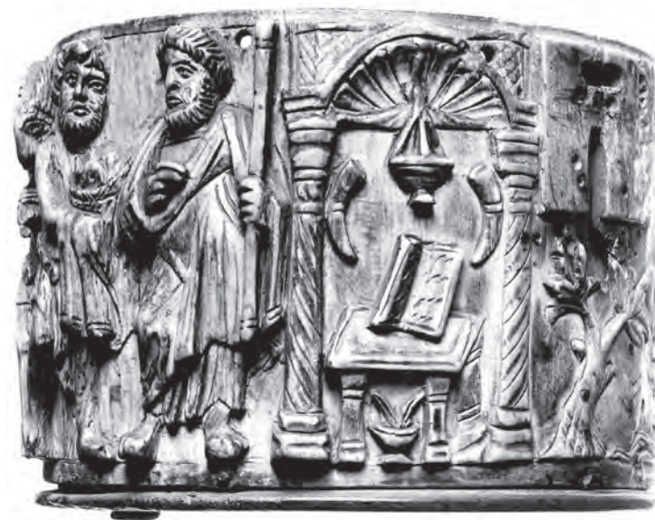
Fig. 1. Sacrifice before the Tabernacle, Basilewsky pyxis , 6 th c., St. Petersburg, Hermitage Museum