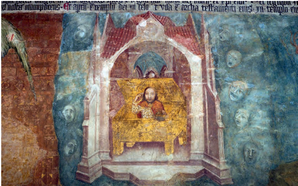
Fig. 7. Ark of the Covenant, Chapel of the Virgin, ca. 1358-65, Karlstejn Castle

Like the desert Tabernacle, Jerusalem Temple, and the pictured sanctuary itself, the Karlstejn chapel in which this image appears, is divided into two spaces. In the real room, the transition from the one to the other is effected by the window niche across opposite the