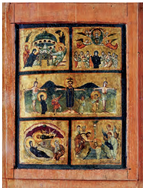
Fig. 15. Reliquary, inner surface of lid, 7 th c., Rome, Museo Vaticano

our Lord God and Savior Jesus Christ called the acheiropoieta , and along with it he brought forth various other sacred religious objects” 52 . The sacra mysteria were most likely reliquaries, which in the eighth century, would almost certainly have included this box. In fact, the reliquary’s roundover and rabbitted edges invite picking up; and the careful carpentry recalls a flat-bottomed boat (as on the Trier sarcophagus) intended to transport precious cargo. The lid, it should be noted, was fitted onto the box and equipped with a crescent notch for sliding it off; the fact that it is not held in place by a groove or attached hinges or clasps would not preclude its being carried in covered hands, as a cleric does in the scene of the Translation in San Clemente 53 or as Pope Stephen VI is shown in the sixteenth-century fresco in the Sancta Sanctorum itself. The outer surface is painted in encaustic, moreover, a medium that Pliny reports was valued for its durability and hence used for the outside of ships 54 . Like the Acheiropita, the lid shows signs of wear, albeit not as much.