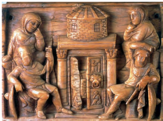
Fig. 3. Three Marys at the Tomb, 5th c., Maskell ivory, London, British Museum