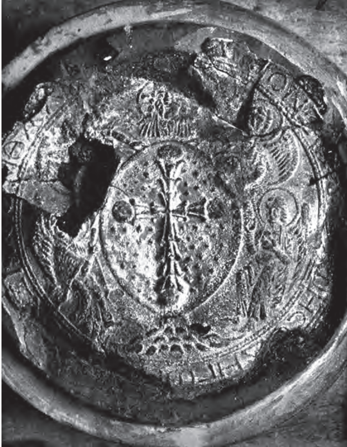
Fig. 10. Tree of Life, 6 th /7 th c., ampulla, Monza Cathedral

niche reinforces the hope of salvation for those sitting on the benches waiting to enter the adjacent chapel also by means of a depiction of the Harrowing of Hell with Christ dragging Adam and Eve and other “Old Testament saints” from an enormous cave. The phenomenological recreation would have been engendered dramatically by the window itself that presumably once filtered light into the space through siliceous stone (of which a fragment still survives; Fig. 11), coarse matter transformed by the divine radiance. Pictures adjacent to the niche representing Charles IV receiving the Passion relics and inserting them into a cross, visible from the niche, complete the transition to a small inner chapel. The Emperor, wearing a miter beneath his imperial crown, is imagined here as Melchizedek, the king/priest at the entrance of his own sancta sanctorum. Inside, the stone-covered walls create the experience of the Heavenly Jerusalem that, through Christ’s death (pictured on the altar), replaced the earthly one. That experience culminated in the Holy Cross chapel above, with its dado of encrusted stones from which crosses emerge, its glimmering vaulting affixed with Venetian glass spheres, and the portraits of 130 saints with relics inserted into the frames, themselves the lapides vivi of