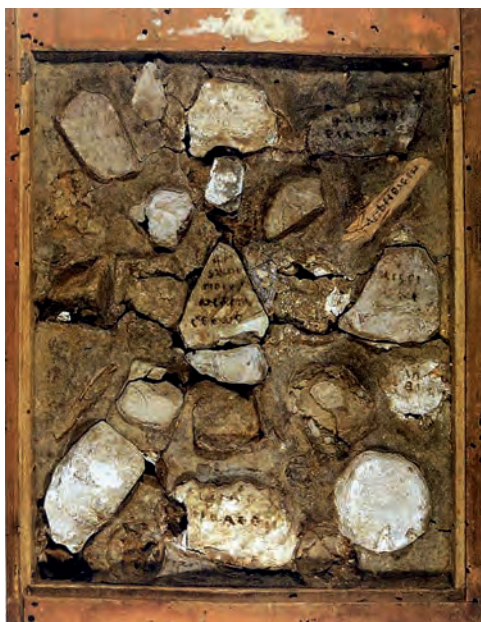
Fig. 16. Reliquary, box, 7th c., Rome, Museo Vaticano

How precisely the box was arranged beneath the icon is not known; but the Trevisano copy attests to the fact that, by the thirteenth century, the positioning was firmly cemented. The prominent semi-circular inventory painted sub pedibus this Savior lists numerous relics, many of them, such as pieces of the lignum crucis and lapide sepulchri also in the Sancta Sanctorum , as well as physical mementoes of Roman saints Lawrence, John the Baptist, Primus, Felicianus, Anastasius, and Nereo and Achilleus 58 . The Acheropita's Luke legend suggests that the arrangement of earth below and Christ above may have been inspired by a representation of the Ascension, as on Holy Land ampullae and inside the Sancta Sanctorum box, which pictured Mary watching and the apostles recoiling in astonishment and sorrow as the enthroned Christ borne up by four angels rises to heaven. In a fresco Pope Leo IV (847-55) introduced into the Lower Church of San Clemente (Fig. 17) 59 , moreover, the world Christ leaves is activated by an inserted relic, presumably a stone from the Mount of Olives, or perhaps more than one given its size, the others possibly related to the scenes on the adjacent wall: the Crucifixion, Maries at the Tomb, Anastasis, and