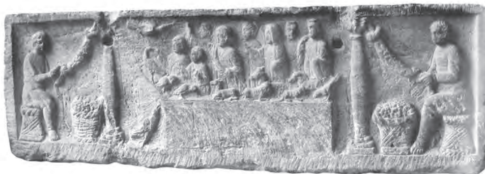
Fig. 2. Noah and his Family in the Ark, 4th c., Trier, Rheinisches Landesmuseum