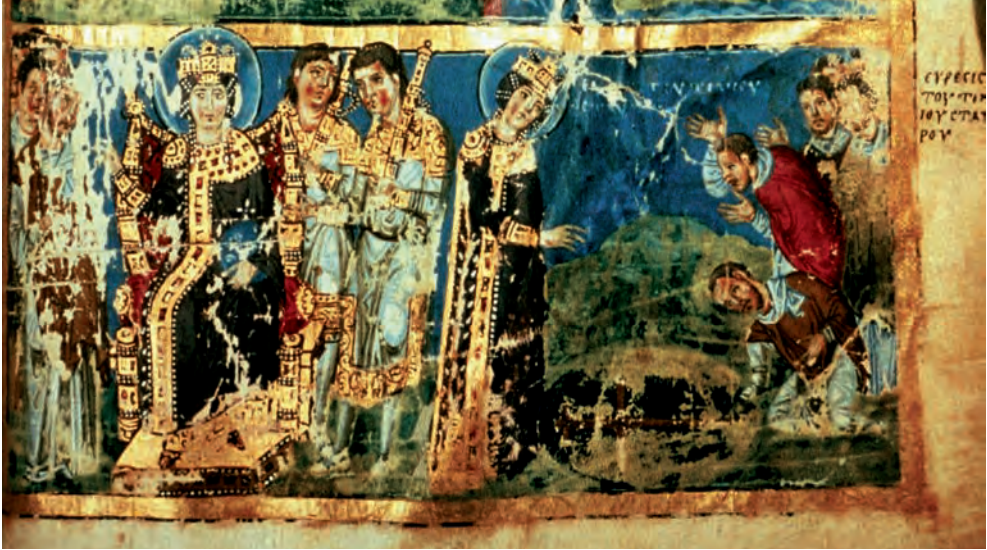
Fig. 18. Helena Finding True Cross, 9th c., Paris, BnF, Ms. gr. 510, fol. 440r

At Karlstejn, too, the collecting of base materials, the fixing with labels and images, the creating of narratives of looking, concealing, opening, and closing, blurred the distinctions between inert and dynamic, and between past and present. Withdrawing, after prayers, from the complex experience of tomb and heaven in the inner Chapel, Charles IV and his empress first confronted their own portraits in the guise of a new Constantine and Helena and then faced depictions of the end of time on the entry wall, reminding them that earthly power is transient, just as the Ark of the Testament was, and will cede to God's judgment.