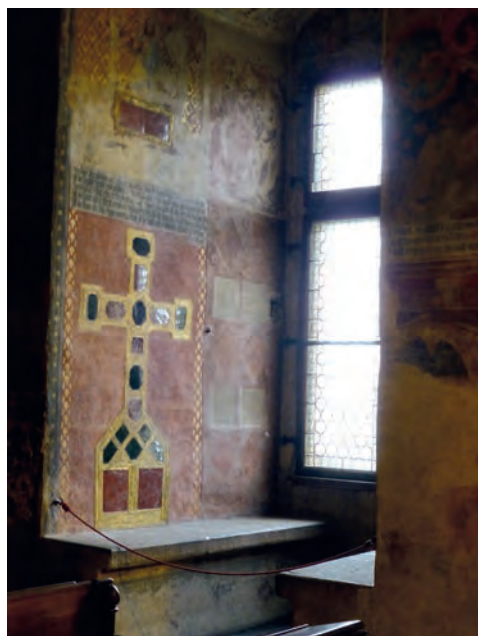
Fig. 8. Window niche, Chapel of the Virgin, ca. 1358-65, Karlstein Castle

entrance and across from the painting (Fig. 8), where Christ appears again rising from a box holding the cross of resurrection as he emerges from his tomb (Fig. 9) 21 . Christ's sarcophagus is here made partly of actual stone (possibly of a later date) framed in gold, behind which actual relics were secreted; like the oil in the ampullae and the wafers in the Basilewsky pyxis , these replace the Savior's person (which was now with the Father) with physical objects that conserve something of his divine aura. Among those inventoried in the list below are stones from Christ's tomb, from the Virgin's grave, from the place of the Last Supper, from where Thomas touched Christ's wounds, from the place where Mary died, and from where Christ Ascended 22 . An enormous Crux gemmata fashioned of precious stones may recall the cross in situ in Jerusalem 23 ; but, set against a curtain-like painting "woven" with leaves, it evokes not only the curtain of the Epistle to the Hebrews, but also another ancient typology, pictured on the Holy Land ampullae (Fig. 10), too, namely, the belief that the cross is a new tree of life (from which it was constructed) that, through Christ's death, returns humankind to the walled-off Paradise 24 . Recreating the experience of a tomb through its confinement and darkness, the