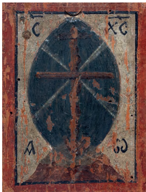
Fig. 14. Reliquary, outer surface of lid, 7 th c., Rome, Museo Vaticano