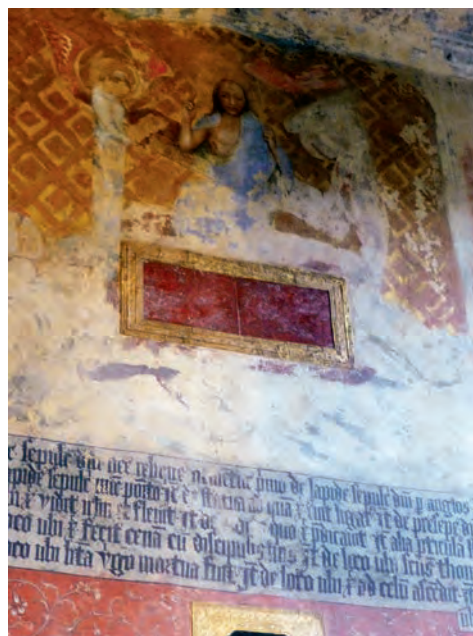
Fig. 9. Resurrection of Christ, Chapel of the Virgin, ca. 1358-65, Karlstein Castle