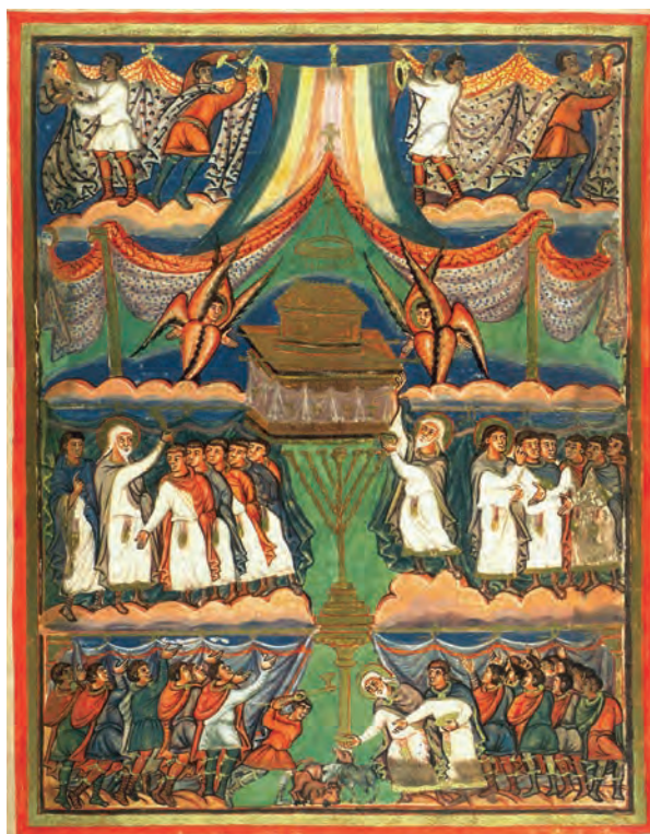
Fig. 5. Tabernacle, 9 th c., Rome, Monastero di San Paolo, Bible, fol. 32v

Paolo Bible of ca. 870 (Rome, Monastero di San Paolo, Bibbia, fol. 59v) 10 , for instance, illustrates the sacred box's power to part the Jordan and cause the Chosen People's enemies to fall in what, the accompanying titulus declares is a prefiguration of the "celestial kingdom" 11 . In the desert Tabernacle's inner tent and, later, atop the propitiatorium in Solomon's Temple, the Ark was too dangerous to approach, as the San Paolo Bible Leviticus page shows (fol. 32v; Fig. 5) 12 . It was accessible only on the Day of Atonement and by the High Priest alone, who entered the Sancta Sanctorum to sprinkle the sacrificed animal's blood on the altar in expiation of humankind's sins. The Carolingian frontispiece pictures the workers in the upper corners completing the physical tent which frames a hierarchy of sanctity that begins at the bottom where Moses and Aaron oversee the sacrifice outside the precinct, into which the hoi polloi desire to peer but are blocked by a curtain, continues within the outer courtyard where Aaron