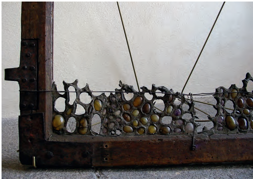
Fig. 11. Window fragment, ca. 1358-65, Karlstejn Castle

the Heavenly Jerusalem (Rev. 21) 25 . The succession of anagogical objects and images reaches its climax at the altar, which is surmounted by an enormous niche for the Passion relics and imperial insignia and adorned with various images, including, prominently Christ as a man of sorrows within his tomb 26 .